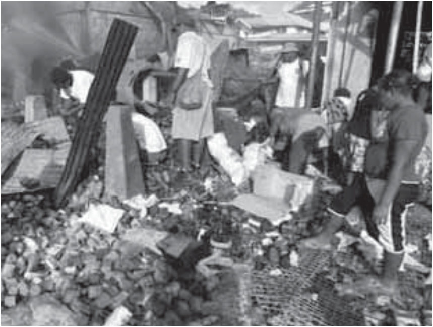
Residents search for useable canned food from a wrecked store in Chinatown in Honiara, April 20, 2006 where only ten percent of the buildings were not burnt to the ground following riots and unrest after the national election.

October 2000 by 143 men representing the MEF and IFM plus the national and provincial governments. All civil society groups were excluded at the insistence of the MEF. 125 Thus the conversation included only the war makers, not a wide array of peacemakers.