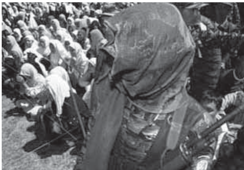
A Moro Islamic Liberation Front fighter separates the women from the men during a gathering in the group's Camp Bushra, Mindanao, March 2008.

women listened to the women from Mindanao describe their pain and the disruption of their lives as a result of continued displacement. "I didn't know that we hurt you so much. Please forgive us" said one woman in Pangasinan, a province in Northern Luzon, for whom the war in Mindanao was formerly a distant issue. 39