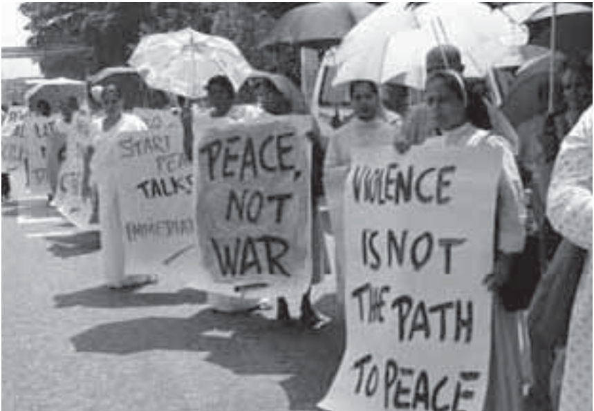
Women demand dialogue during a demonstration against the war in Colombo January 23, 2006. Suspected Tamil Tiger rebels ambushed and killed three soldiers in the east days before, just as a Norwegian peace broker flew in to begin a last-ditch peace bid to avert a slide back into civil war.

A pragmatic choice was made in favour of engagement at the level of formal peace talks. I believe this allowed for the sharing of experiences and strategies and the shaping of policy interventions in key arenas of marginalisation for both LTTE women and women/feminists from the women's movement outside the LTTE.