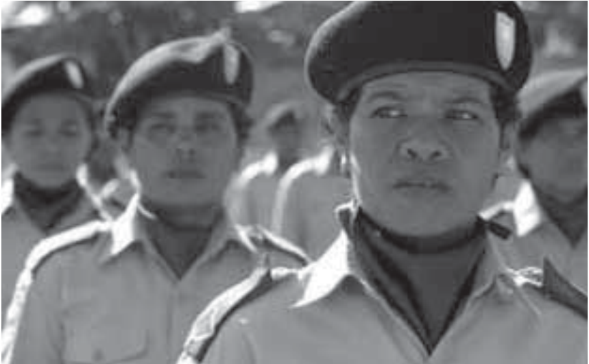
Women police officers line up during a ceremony of the national police's second anniversary in Dili, Saturday, March 27, 2004.

no women signatories, no women mediators and no women witnesses to the agreement. 80