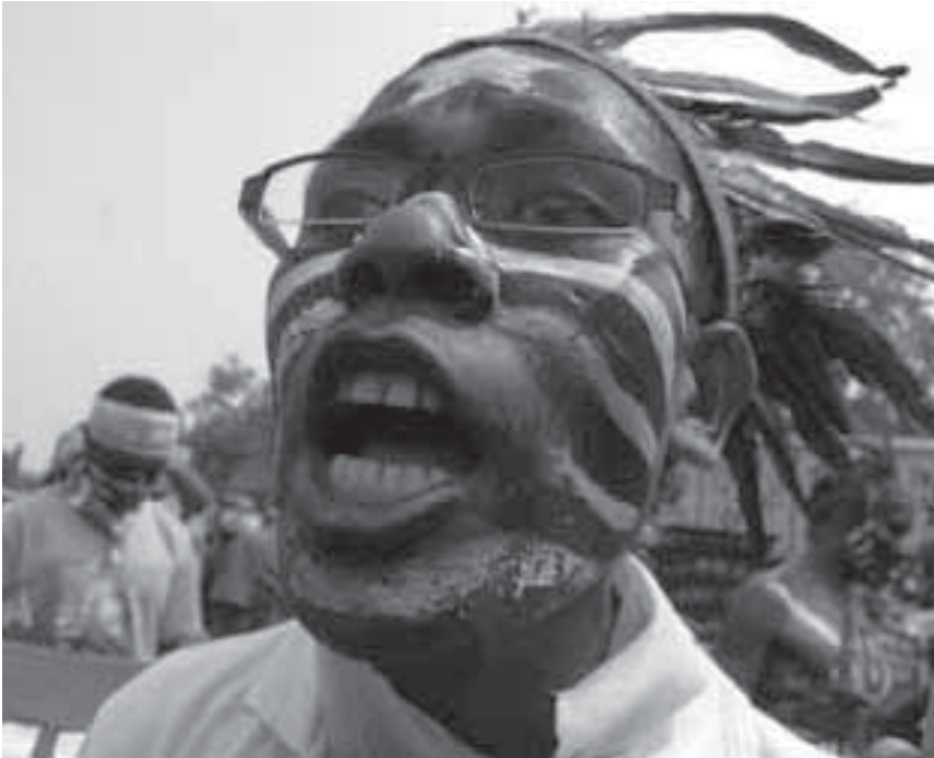
Papuan woman demonstrates for greater autonomy in Jakarta.

Even in Papua, where women have been more actively involved in informal peace talks to resolve conflict or calm tension between Papuans and the Indonesian officials (or between different elements of civil society) their presence at formal talks is limited. 56 Efforts to involve women in peace talks are mainly driven by women's groups, such as Solidaritas Perempuan Papua-SPP, (Papua Women's Solidarity).